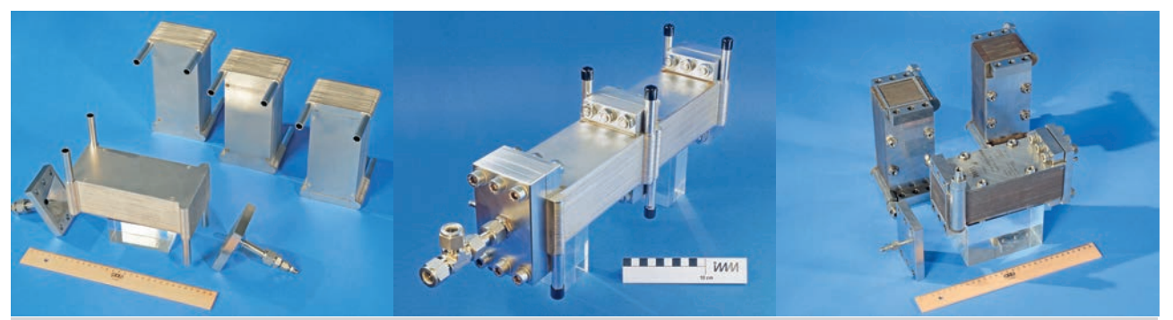
Vacuum brazed (left) and laser welded (right) reactor modules comprising plates microstructured by roll embossing, threefold modular test reactor (mid).