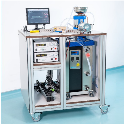
Mobile reactor unit for on-site use.